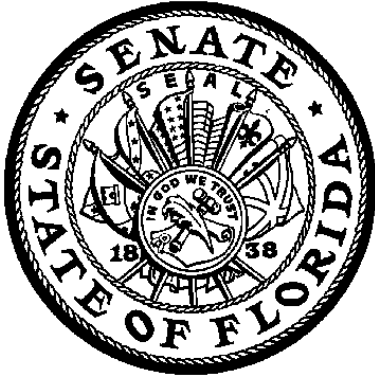
The Florida Senate